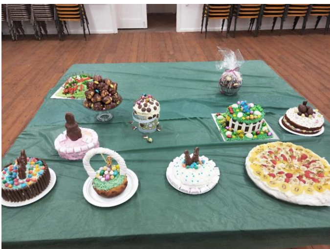
Some of the entries for the competition