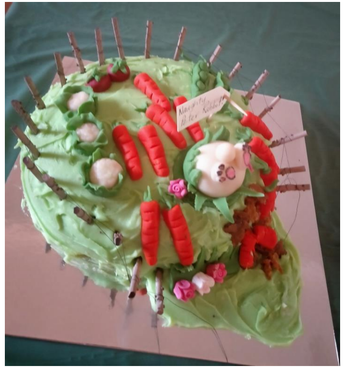
The winning entry. Peter Rabbit strikes again.

Thank you to everyone who contributed to making the evening once again a massive success. Whether you purchased a delicious hot meat and gravy roll, baked a cake, bought a cake or just came along to enjoy the evening, the Greenethorpe Public School P&C thank you.