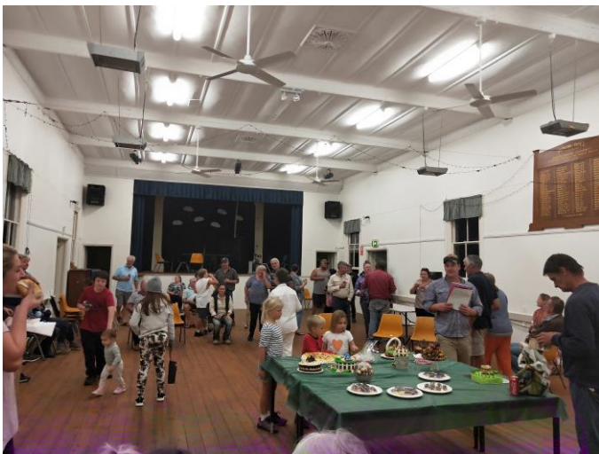
Locals enjoyed catching up at the Cake Auction